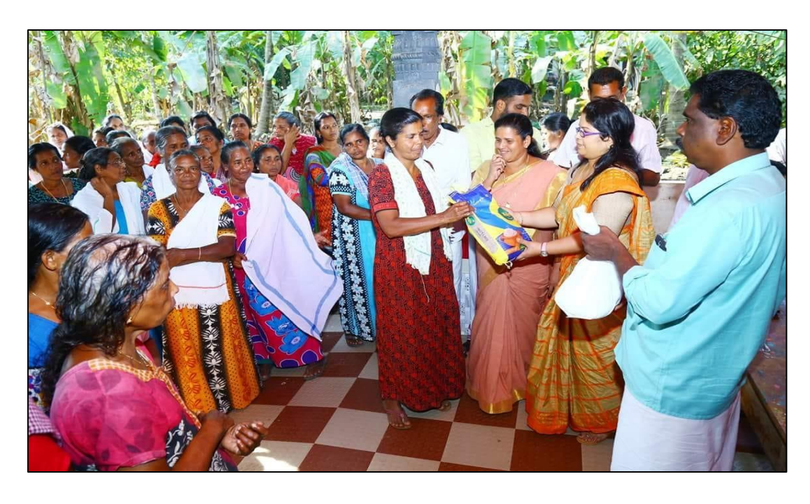
4) 6/9/2018 Kerala Government Pollution control Board organise a training class related to well water quality test.