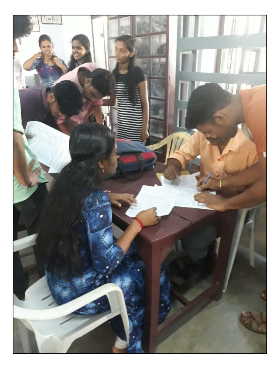
18) Mental Health Class By Aster Medicity Ernakulam.